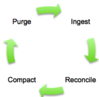
Figure 1.3. Data Ingestion Lifecycle

The base table is a Hive internal table, which was created during the first data ingestion. The incremental table is a Hive external table, which likely is created from .CSV data in HDFS. This external table contains the changes (INSERTs and UPDATES) from the operational database since the last data ingestion.